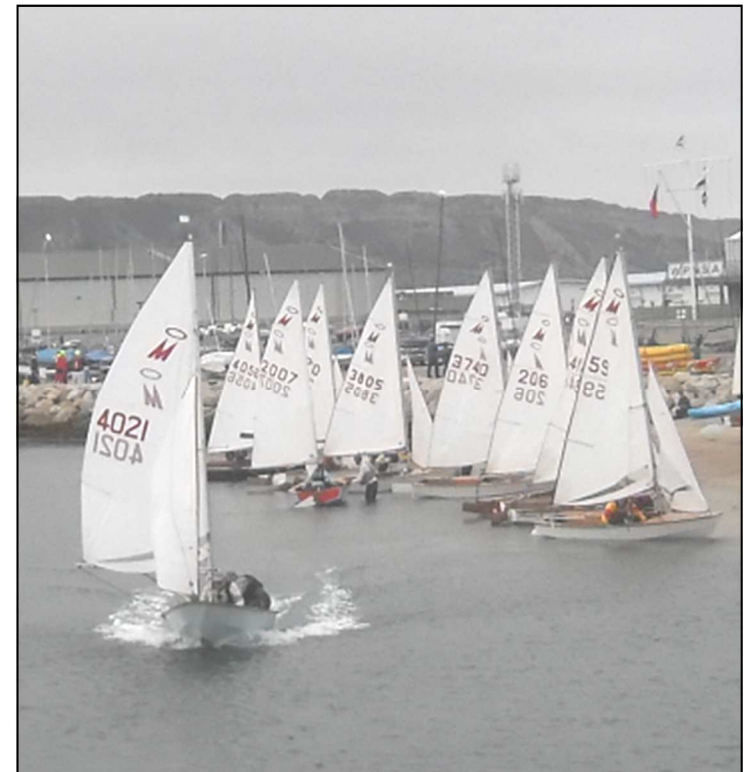
Launching at Weymouth

Miracle Association Magazine Autumn 2013